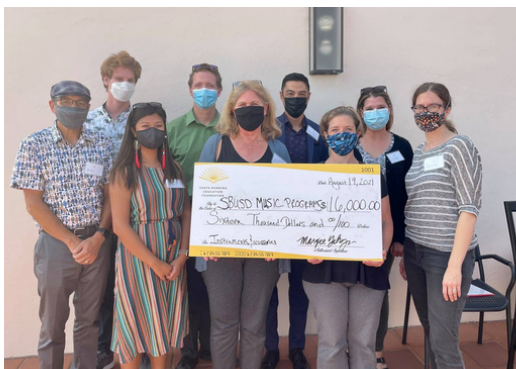
SB Unified music teachers with their annual gift from SBEF.

The ringing of school bells isn't the only sound that reminds us that Santa Barbara schools are back in session. The sound of violins, mostly played in unison, echoing through local campuses, let us know that our school music education programs are also back in session.