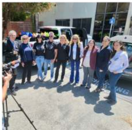
Adam's Angels volunteers collect hygiene kits to distribute to schools.

The We Care campaign ensures that students of families who are struggling have what they need to attain a quality education and successful academic outcomes. It gives under-resourced kids the opportunity to focus on what's most important — their learning.