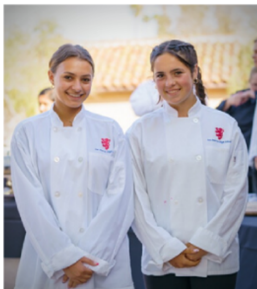
Culinary students from all three high schools served guests at tasting stations.

When accepting the award, he made it very clear that despite his career and involvement in a lengthy