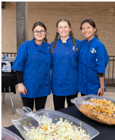
Dos Pueblos High School culinary students serve up salads at the Hope Awards.

On Thursday, May 5, the Santa Barbara Education Foundation hosted the Hope Awards to celebrate individuals and programs supporting students in the Santa Barbara Unified School District. The annual event raised over $110,000 in funding for the Santa Barbara Education Foundation to continue making a positive impact on SB Unified student outcomes.