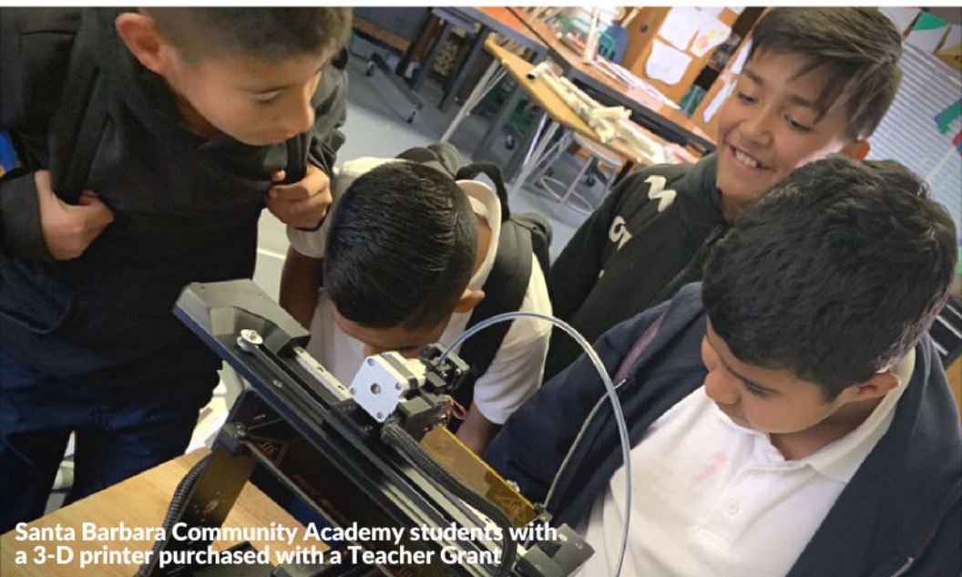
Santa Barbara Community Academy students with a 3-D printer purchased with a Teacher Grant

GOOGLE GRANT HOPE AWARDS STATE OF OUR SCHOOLS