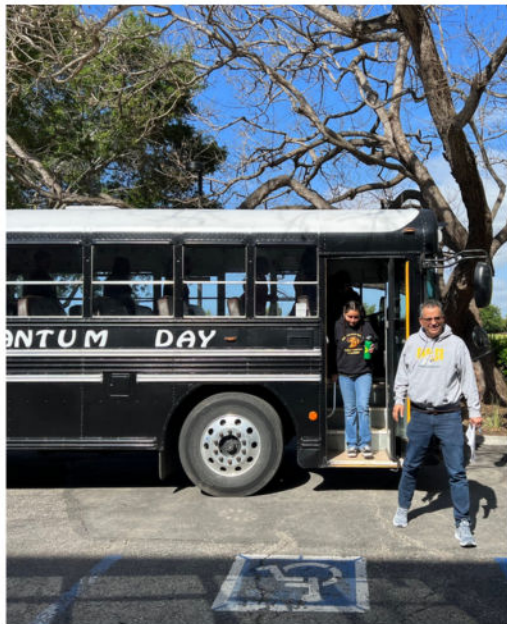
Franklin Elementary School students and staff arrive at Google's Quantum AI Campus.